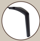
NNA black or alu

HEIGHT: 82 cm DEPTH: 95 cm SEAT DEPTH: 58 cm SEAT HEIGHT: 47 cm ARM HEIGHT: 55 cm